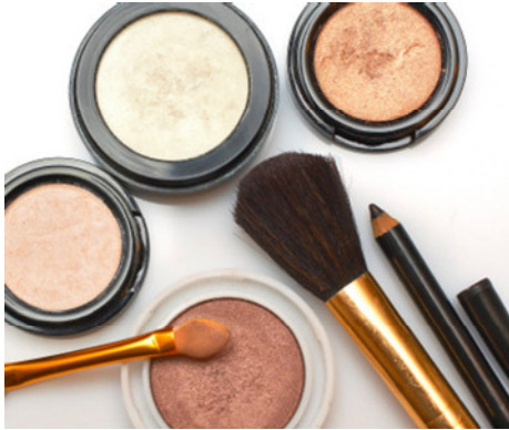
Make up pots

Can you find the Ancient Egyptian versions of these modern objects?