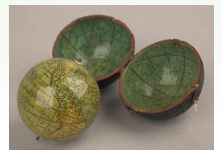
Made by Darton and Co. in 1811