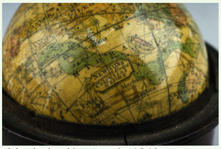
Made by Newton in 1840