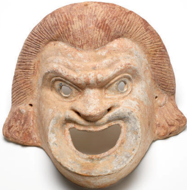
Hellenistic New Comedy actor mask (200 B.C. — 101 B.C)

These masks would have been worn by actors in the theatre. The one on the left shows a wavy-haired leading slave, the one on the right is an architectural ornament of a mask. The facial features are representations of the actors, exaggerated so they can easily be seen from a distance.