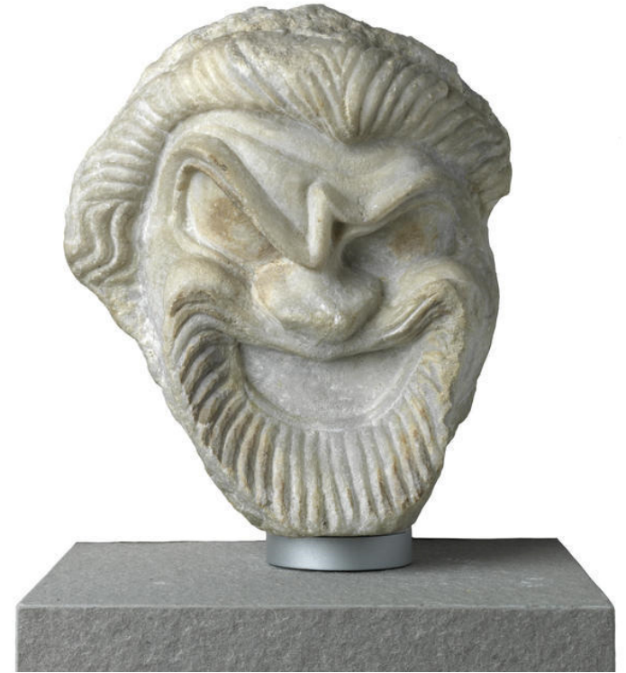
Early Roman Dramatic mask for a Comedic Slave (1 — 100 A.D)

These masks would have been worn by actors in the theatre. The one on the left shows a wavy-haired leading slave, the one on the right is an architectural ornament of a mask. The facial features are representations of the actors, exaggerated so they can easily be seen from a distance.