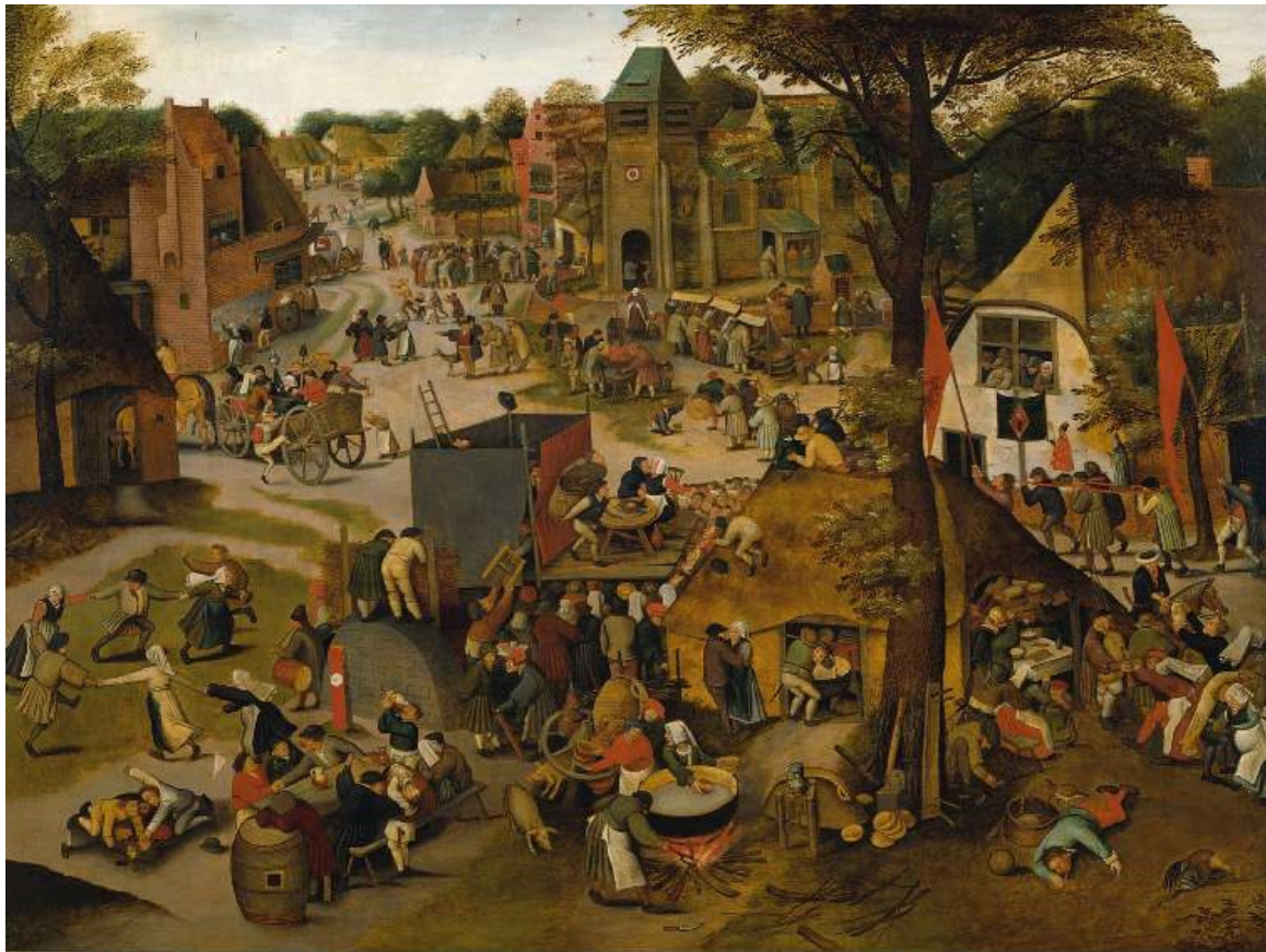
“A Village Festival, With a Theatrical Performance and a Procession in Honour of St Hubert and St Anthony” by Pieter Brueghel, the younger (1564-1638)

This painting, by Pieter Brueghel the Younger, shows a village in the middle of a religious festival. The peasants in the scene, however, are more interested in the theatrical performance and the drunken revelries taking place.